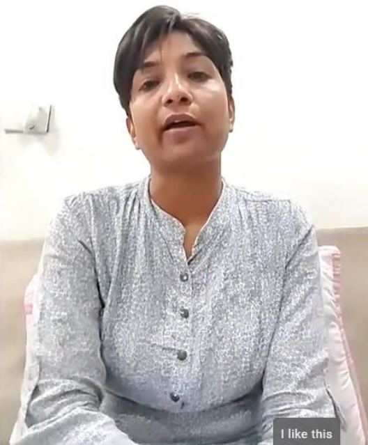
I like this